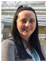
Mercedes Apps Team Leader